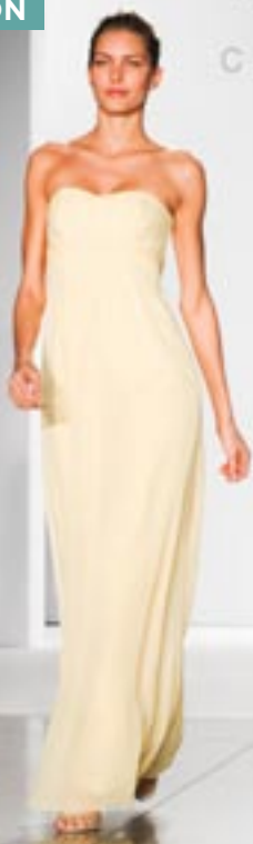
Vineyard Collection Canary chiffon gathered gown. $220