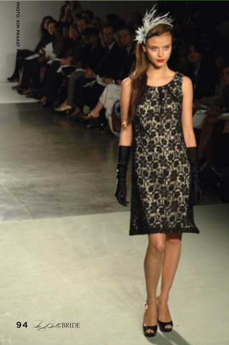
Melissa Sweet Black lace sleeveless dress with jeweled neckline embellishments. $260