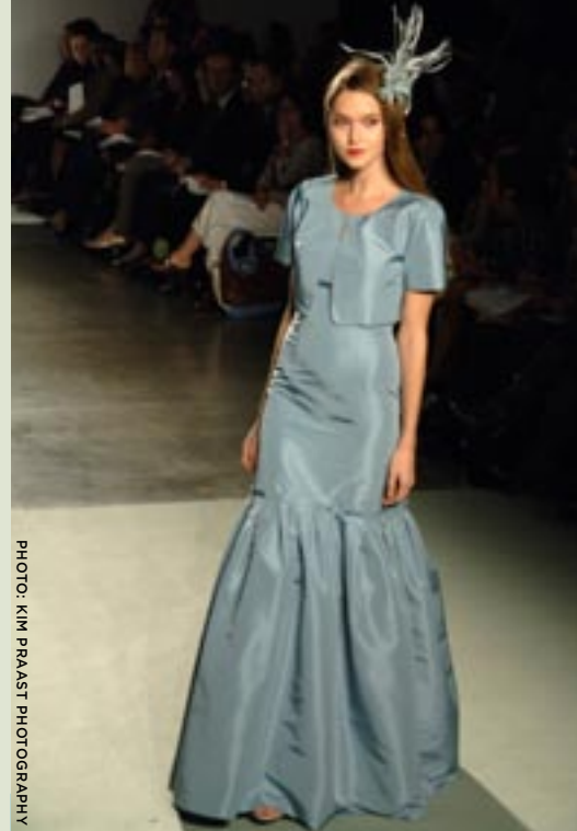
Vineyard Collection Marine faille dress with hem flounce. $200